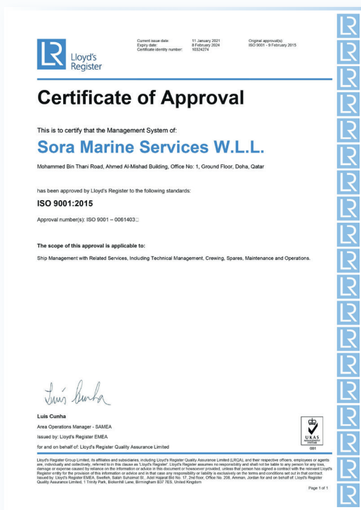
ISO 9001:2015 – by Lloyd's Register