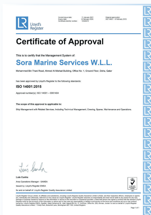
ISO 14001:2015 – by Lloyd's Register