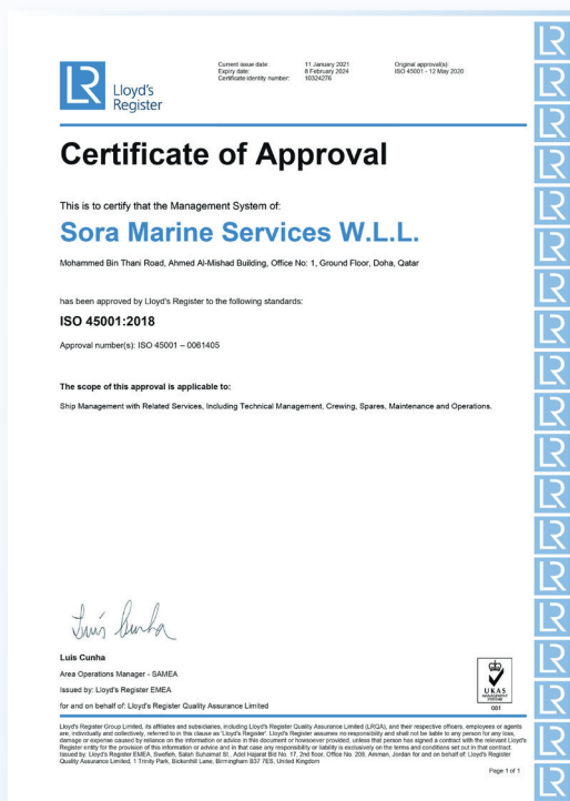
ISO 45001:2018 – by Lloyd's Register