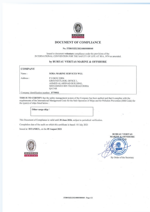
ISM Code – by Bureau Veritas